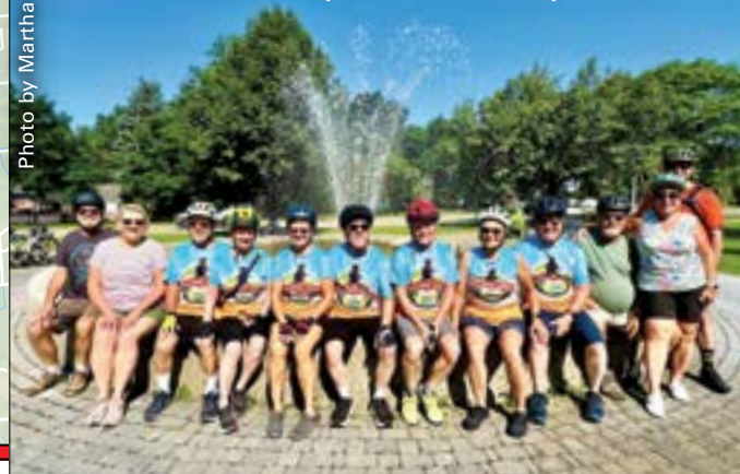
The Rolling Hills Cycling Club at the Paul F. Baker Memorial Fountain in South Lyon on the Huron Valley Trail.

Part of the 104-mile Huron River Water Trail that flows from Proud Lake to Lake Erie, the 14-mile section of the water trail shown on this map offers easy access and riverside camping. You'll need to make two portages: at Hubbell Dam and Kent Lake Dam. For information about the entire Huron River Water Trail and its amenities, access sites, float times, portages and outfitters, visit: HuronRiverWaterTrail.org