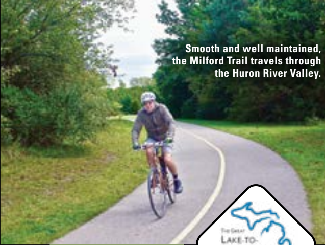
Smooth and well maintained, the Milford Trail travels through the Huron River Valley.